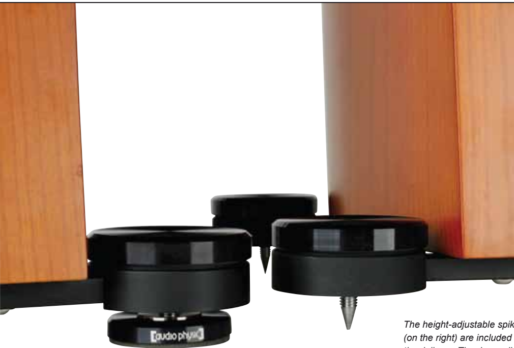
The height-adjustable spikes (on the right) are included in the delivery. The decoupling VCF feet can be purchased as an optional extra.